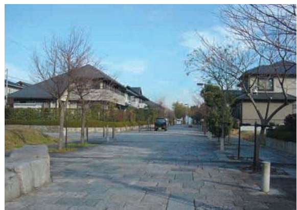
Conservation of the environment in the low housing area (Nishikyo Katsurazaka District )