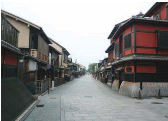
Conservation of downtown area (Gion South District)