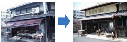
Example of renovations supported by the subsidy program

Management of “Landscape and Community Development College” class.