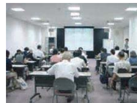
College of Landscape and Community Development