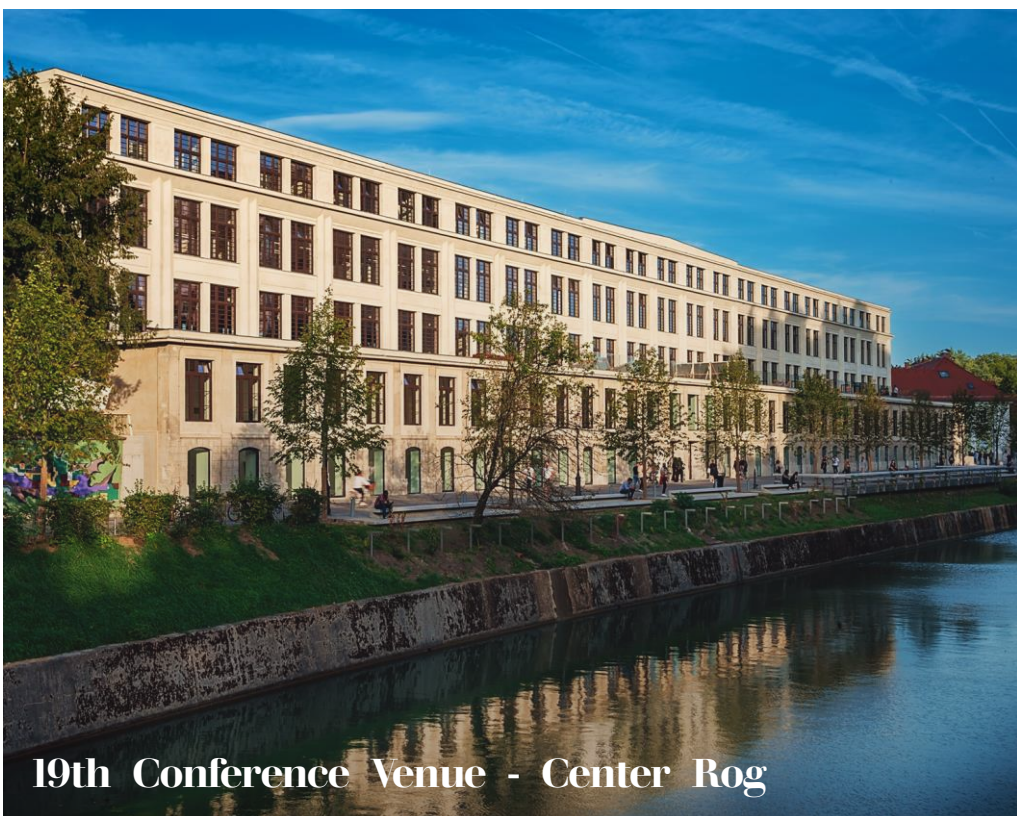
19th Conference Venue - Center Rog