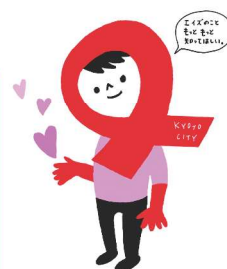
Kyoto City AIDS Prevention Campaign Mascot "Akarin"