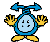
Waste reduction mascot, Meguru-kun